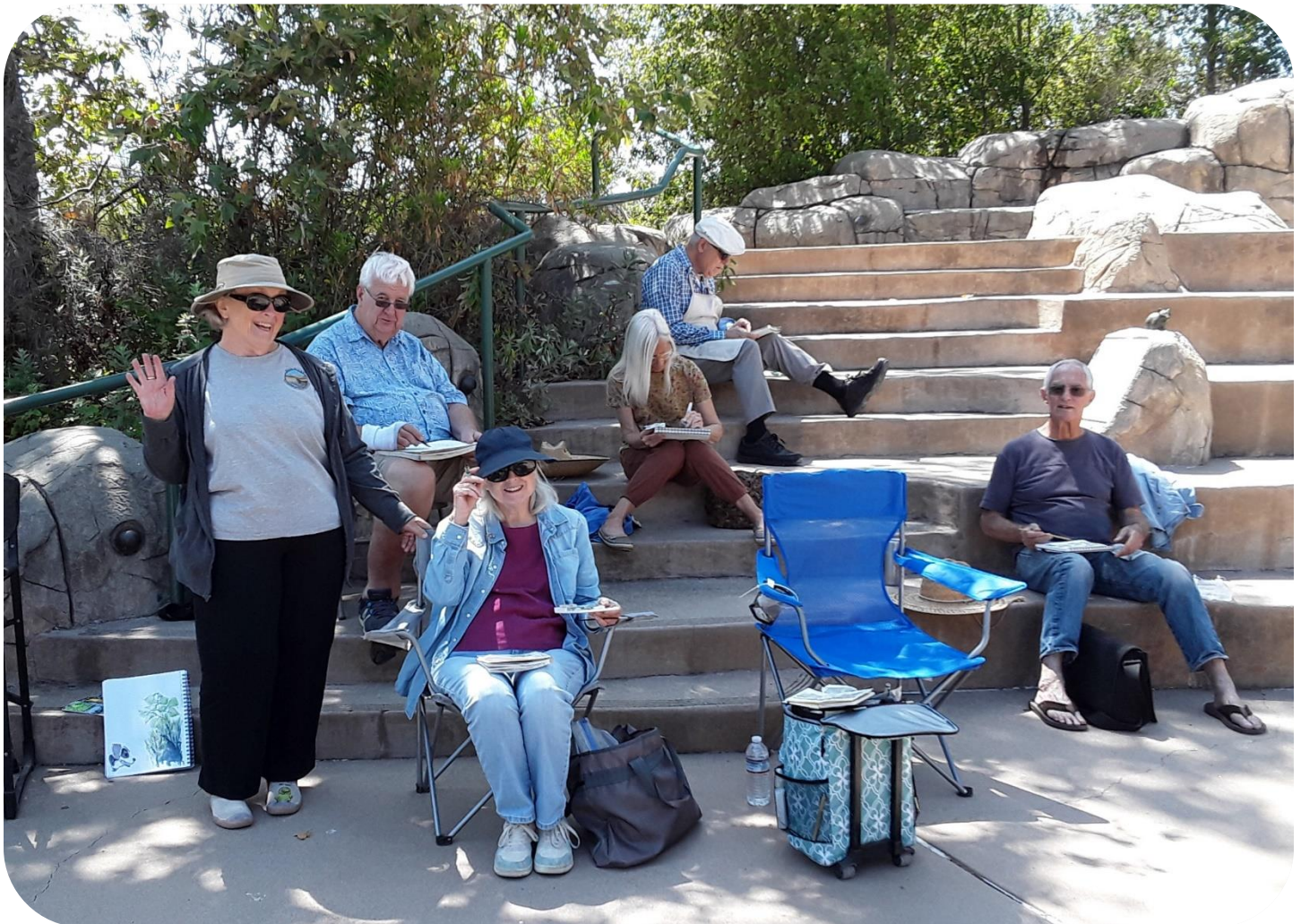
Tuesday Painters enjoying a little shade at Mission Trails Regional Park amphitheater. Consider joining the fun!